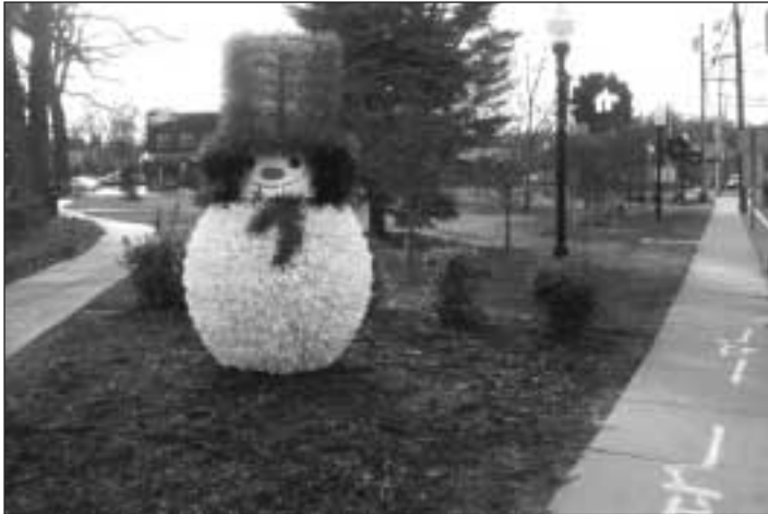
"Holiday decorations downtown".