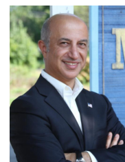
Mayor Mike Ghassali

Borough of Montvale Mayor Mike Ghassali Cell: 201-248-0398