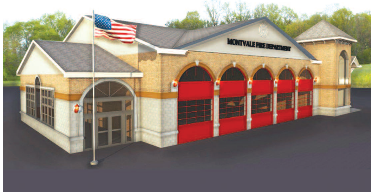
ILLUSTRATION COURTESY OF JOHN DESCANO

The borough's current firehouse will be demolished this spring to make way for a brand new two-story building. Montvale's current building, which dates back to 1955, has suffered structural issues in vears past and has insufficiently sized bays that no longer fit the newer model fire engines and firefighting gear, meriting the need for a new building. Designed by Robbie Conley, an architect and former longtime firefighter, the new firehouse - a red and yellow 16,000square-foot building made up of smooth-face block, brick and stucco