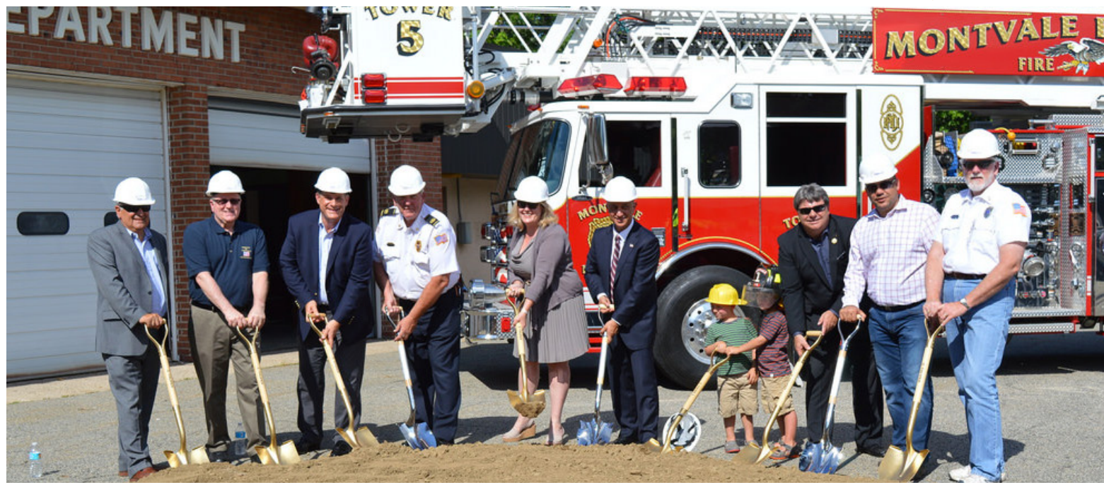
View more photos at www.Montvale.org