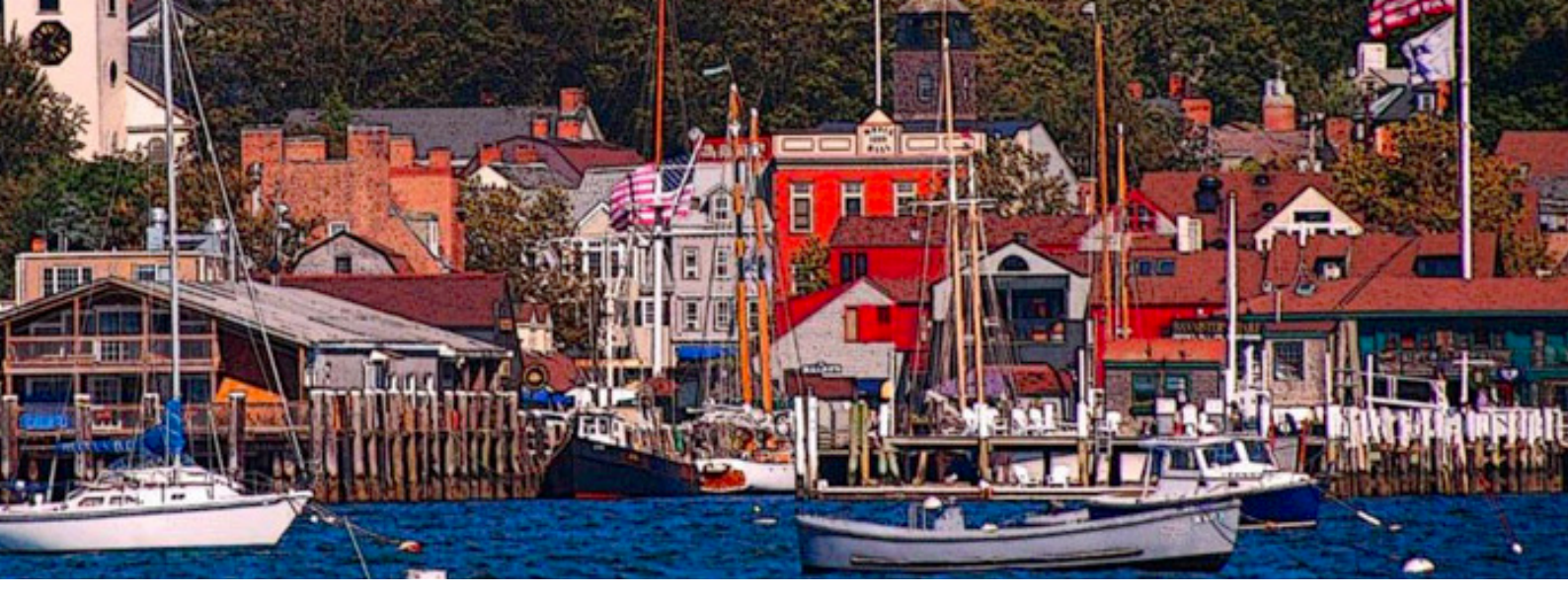
3 DAYS - 2 NIGHTS - $395.00 per person based on double occupancy

For more information and reservations, contact: Rosemarie Kelly at (201) 391-8718.