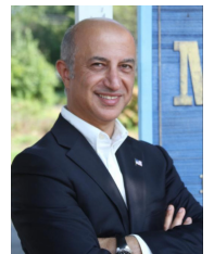
Mayor Mike Ghassali

I am also happy to report that the development in town has resulted in new ratables over the past 2 years that will generate almost $3 million in annual tax revenue. For 2023, we anticipate ratables that would generate $1 million in tax revenue. The addition of these valuable properties to our tax rolls will help blunt the effect of rising costs and stabilize tax bills for existing Borough residents.