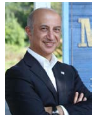
Mayor Mike Ghassali